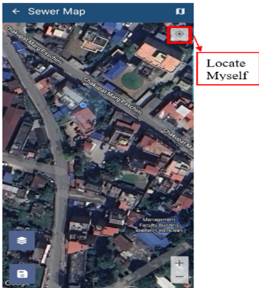
Figure 4-2 Map Interface