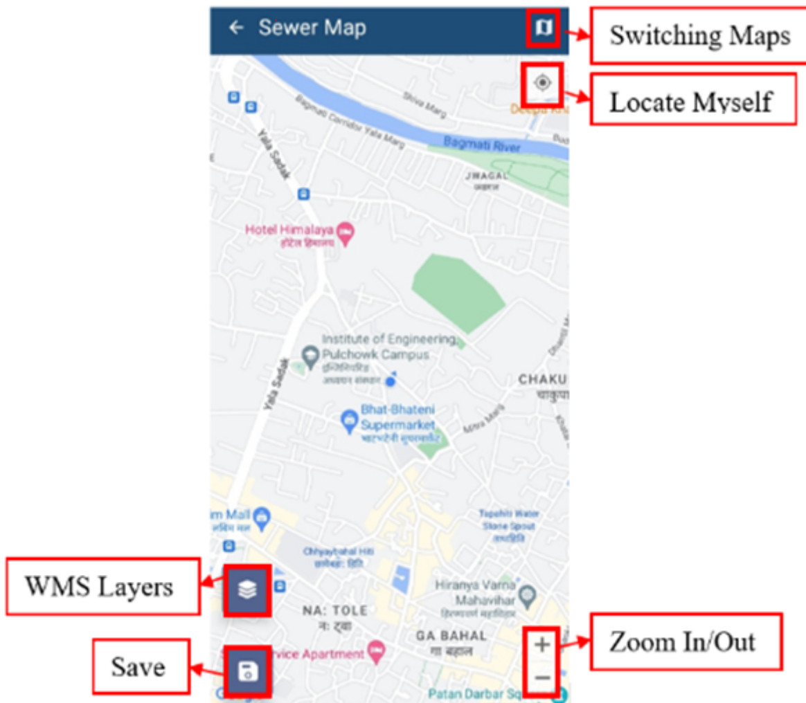
Figure 4-3 Sewer Map