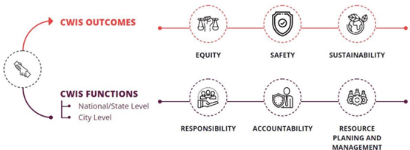
Figure 1 CWIS Service Framework

Citywide Inclusive Sanitation (CWIS) is a public service approach that offers significant benefits in planning, designing, and implementing various ground-level sanitation interventions. CWIS involves demonstrating improved core system functions at different administrative levels to achieve and enhance the outcomes outlined under SDG 6 - Safe, equitable, and sustainable sanitation for everyone in an urban area, with special attention to the needs of the poor and marginalized groups. The introduction of Geographic Information System (GIS) applications has provided the CWIS approach with an enriched quantitative layer to its framework, facilitating a more detailed understanding of potential interventions, even at the building footprint level as part of diverse assessment processes. The GIS based CWIS (G-CWIS) framework not only aids in comprehending the challenges and situations at hand but also helps to understand the volume and nature of required interventions across the value chain. This insight can then be translated into both investment estimates and robust regulatory provisions. This training has applications across all scales of city sanitation project planning and design, including components such as greywater and sewerage systems. Adoption of such innovation has proven to generate evidence-based planning and assists in optimizing the infrastructure needs for system transformations.