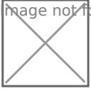
Figure 4 Illustrations of road network extracted from open source, Tarabo (Bangladesh):