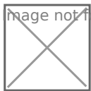
Figure 6 Illustrations of extracted elevation profile, Ranchi (India)