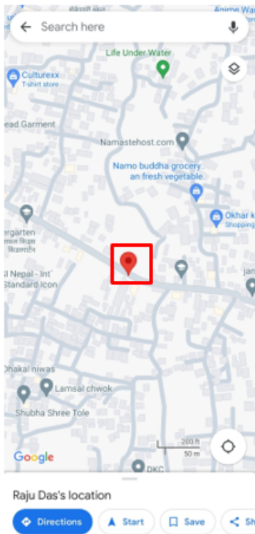
Figure 5-3 Location on Map