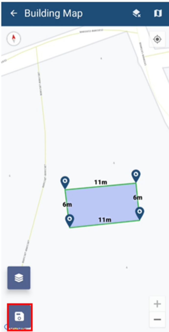
Figure 4-5 Save Button on Map