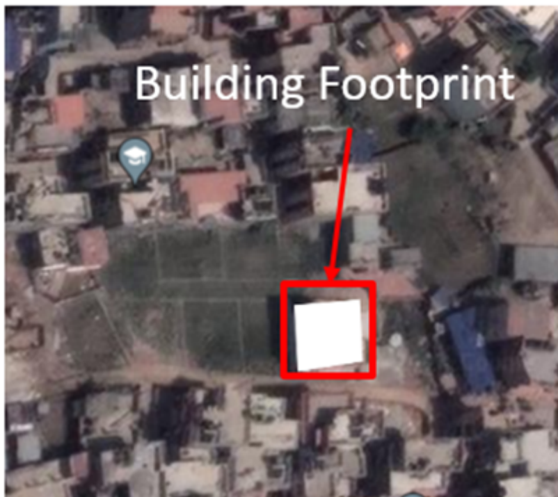
Figure 9- 8 Validating KML file in Google Earth