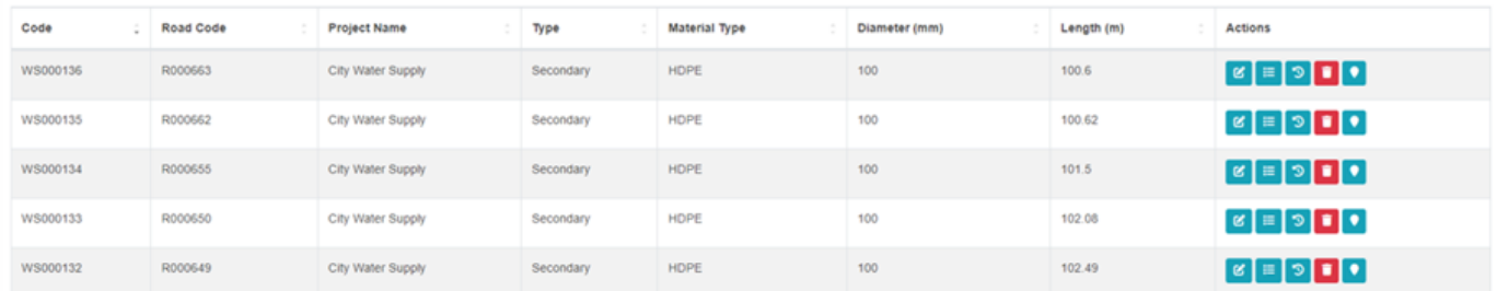
Figure 14- 11 List of Water Supply Network