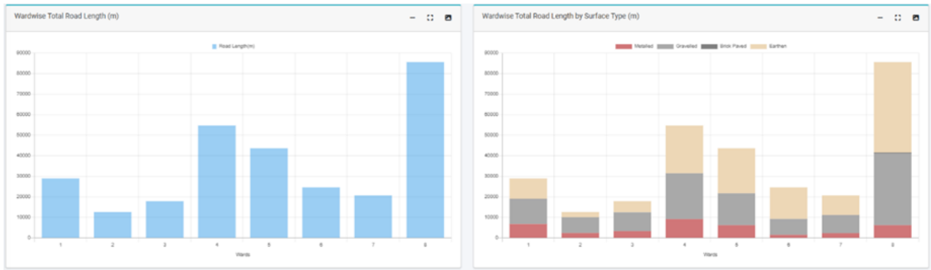
Figure 14- 1 Utility Dashboard

The dashboard typically displays a visual representation of data using graphs, pie charts, etc.